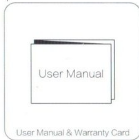
User Manual & Warranty Card