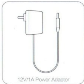
12V/1A Power Adaptor