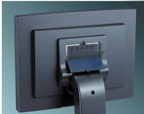
Control Buttons with cover for security